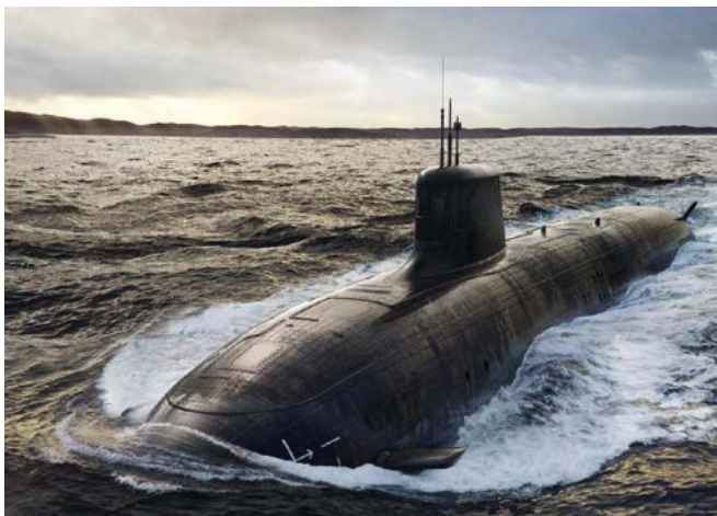
Artist impression of SSN-AUKUS

Pillar Two of AUKUS is accelerating the development and delivery of advanced conventional (non-nuclear) capabilities. It includes regulatory and legislative measures to ease the export and transfer of technology and expands ways of sharing sensitive information. This will enable better integration of security and defence related science and technology, allowing AUKUS states to develop cutting-edge capabilities at the pace and scale of relevance, bolstering our respective industrial bases and supply chains.