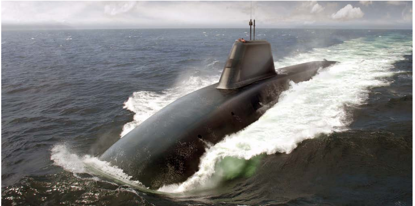
Artist impression of Dreadnought